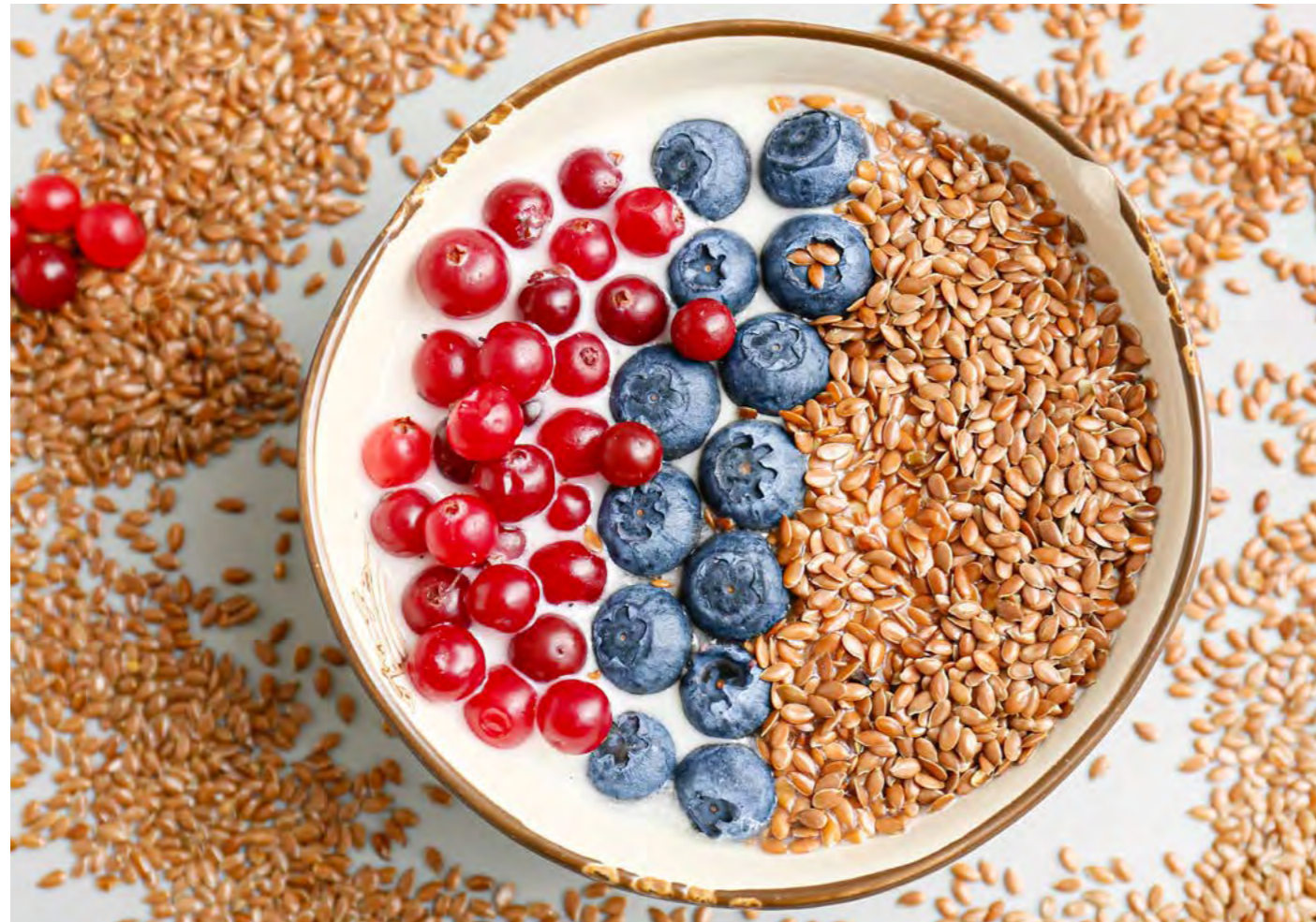
CERTIFIED ORGANIC FLAXSEED 500g