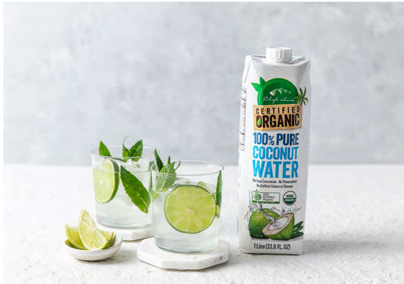
CERTIFIED ORGANIC 100% PURE COCONUT WATER 330ml