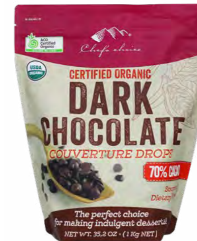
CERTIFIED ORGANIC DARK CHOCOLATE COUVERTURE DROPS 70% CACAO 1kg

PRODUCT CODE: CACAO015 DIMENSION: L:21.7 x W:10.5 x H:26 cms EAN13: 9339337304835 ITF14: 19339337304832 BOX QTY: 10 PC/CTN $24.00