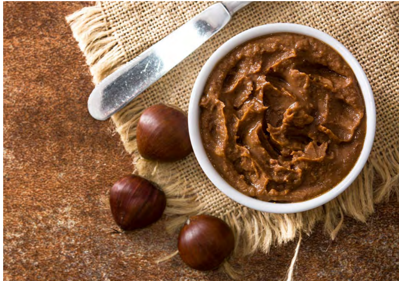
CHESTNUT CREAM WITH VANILLA 325g