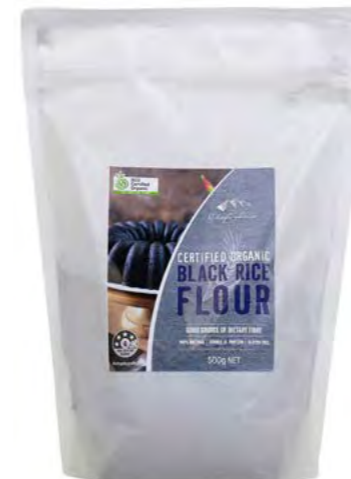
CERTIFIED ORGANIC BLACK RICE FLOUR 500g

PRODUCT CODE: FLOUR027 DIMENSION: L:16 x W:7.5 x H:23 cms EAN13: 9339337307973 ITF14: 19339337307970 BOX QTY: 10 PC/CTN