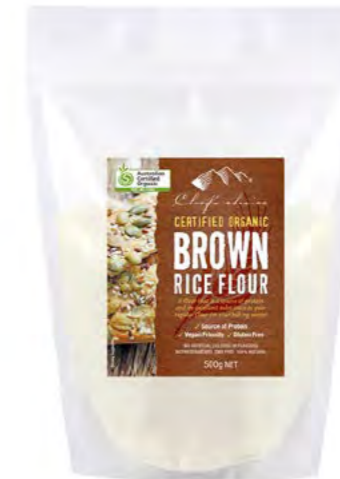
CERTIFIED ORGANIC BROWN RICE FLOUR 500g

PRODUCT CODE: FLOUR026 DIMENSION: L:16 x W:7.5 x H:23 cms EAN13: 9339337003219 ITF14: 19339337003216 BOX QTY: 10 PC/CTN