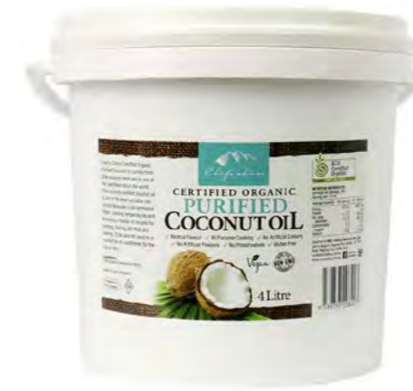
CERTIFIED ORGANIC PURIFIED COCONUT OIL 4L

PRODUCT CODE: OIL028 DIMENSION: L:23.5 x H:20 cms EAN13: 9339337008207 ITF14: 19339337008204 BOX QTY: 4 PC/CTN $42.05