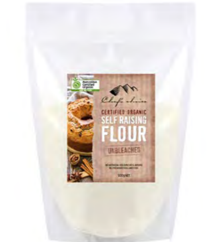
CERTIFIED ORGANIC SELF RAISING FLOUR - UNBLEACHED 500g

PRODUCT CODE: FLOUR022 DIMENSION: L:16 x W:7.5 x H:23 cms EAN13: 9339337003288 ITF14: 19339337003285 BOX QTY: 10 PC/CTN