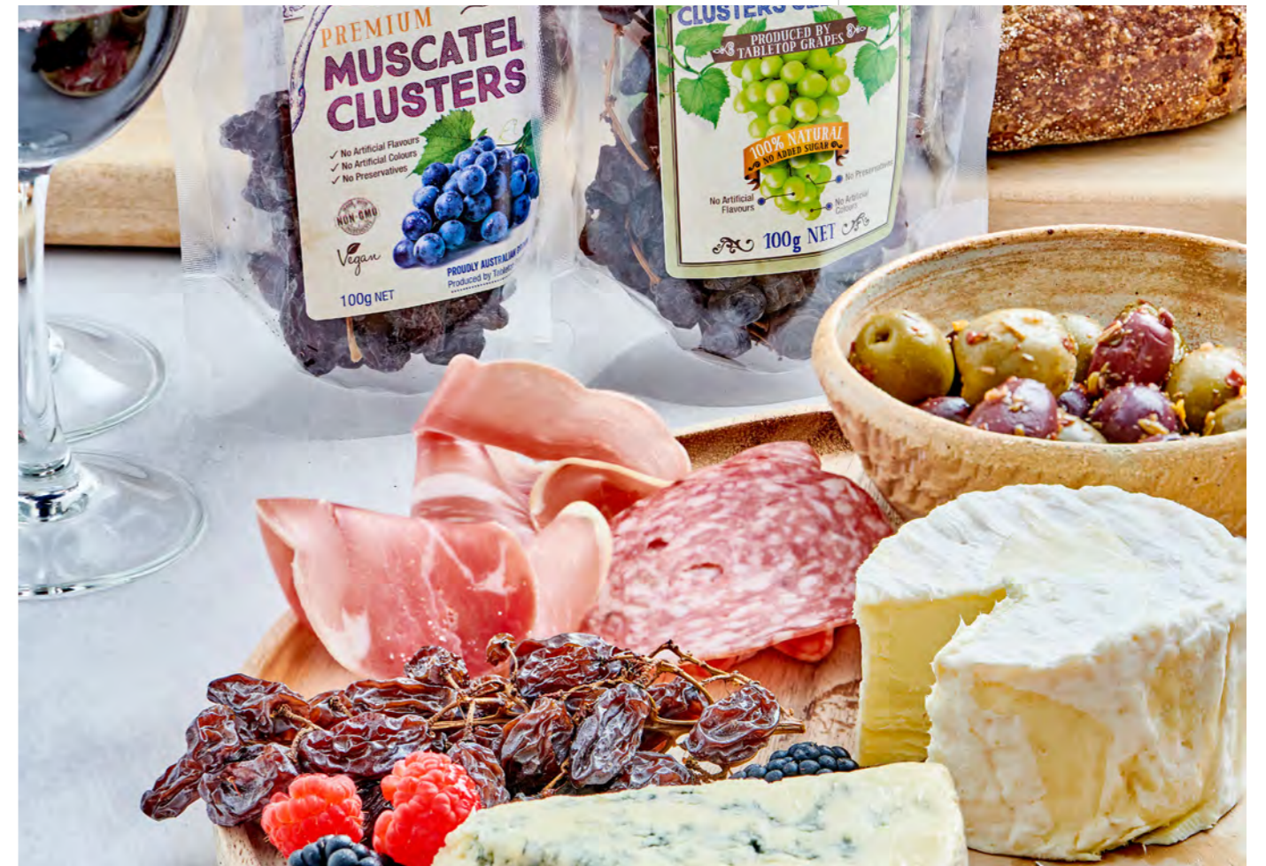
PREMIUM MUSCATEL CLUSTERS 100g

Chef's Choice Premium Selected Roasted Chestnuts are made in France using chestnuts from around Europe and are so tasty that you can eat them straight from the jar, or add whole or chopped chestnuts to stuffing, rice pilaf, soups, sauces or on desserts.