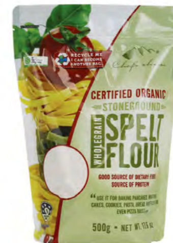
CERTIFIED ORGANIC STONEGROUND WHOLE GRAIN SPELT FLOUR 500g

PRODUCT CODE: FLOUR016 DIMENSION: L:16 x W:7.5 x H:23 cms EAN13: 9339337001666 ITF14: 19339337001663 BOX QTY: 10 PC/CTN