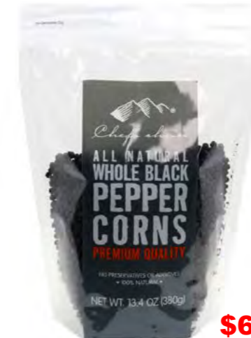
ALL NATURAL WHOLE BLACK PEPPERCORNS - PLASTIC BAG 380g

Our organic black pepper is produced from black immature peppercorns that have been finely crushed to give the texture of coarse ground black pepper.