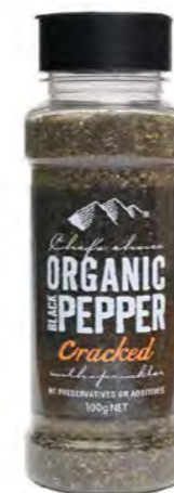
CERTIFIED ORGANIC BLACK PEPPER CRACKED WITH SPRINKLER 100g

It has a sharp yet earthy flavour to give your dishes some wholesome character! White pepper is pickled and processed differently from black pepper, providing a hearty and musty flavour whilst still giving a sharp kick. Enjoy this premium quality whole white pepper over all your dishes!