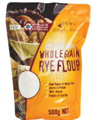
CERTIFIED ORGANIC WHOLEGRAIN RYE FLOUR 500g

PRODUCT CODE: FLOUR014 DIMENSION: L:16 x W:7.5 x H:23 cms EAN13: 9339337001642 ITF14: 19339337001649 BOX QTY: 10 PC/CTN