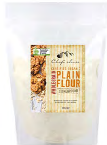
CERTIFIED ORGANIC STONEGROUND WHOLEGRAIN PLAIN FLOUR 500g

PRODUCT CODE: FLOUR030 DIMENSION: L:16 x W:7.5 x H:23 cms EAN13: 9339337003257 ITF14: 19339337003254 BOX QTY: 10 PC/CTN