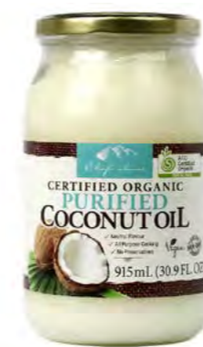
CERTIFIED ORGANIC PURIFIED COCONUT OIL 915ml

PRODUCT CODE: OIL029 DIMENSION: L:9.5 x H:18 cms EAN13: 9339337008191 ITF14: 19339337008198 BOX QTY: 6 PC/CTN $9.75