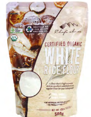
CERTIFIED ORGANIC WHITE RICE FLOUR 500g

PRODUCT CODE: FLOUR018 DIMENSION: L:16 x W:7.5 x H:23 cms EAN13: 9339337003202 ITF14: 19339337003209 BOX QTY: 10 PC/CTN