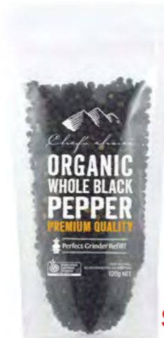
CERTIFIED ORGANIC WHOLE BLACK PEPPER - PLASTIC BAG 120g

Chef's Choice Organic Whole Black Pepper has a sharp penetrating aroma and a woody characteristic. It is hot with a bite and can add flavour and aroma to any exotic dish. It can also be used in spice blends, salad dressings and sauces. Enjoy this premium quality hand picked organic pepper freshly ground over any dish you desire.