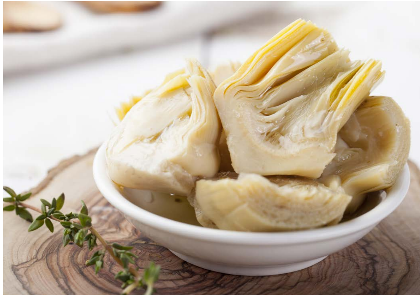
LONG STEM ARTICHOKE – ALLA ROMANA 700g