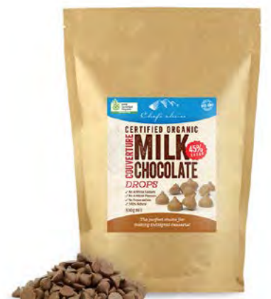
CERTIFIED ORGANIC MILK CHOCOLATE COUVERTURE DROPS 300g

PRODUCT CODE: CACAO010 DIMENSION: L:16 x W:7 x H:23 cms EAN13: 9339337007422 ITF14: 19339337007429 BOX QTY: 10 PC/CTN $9.30