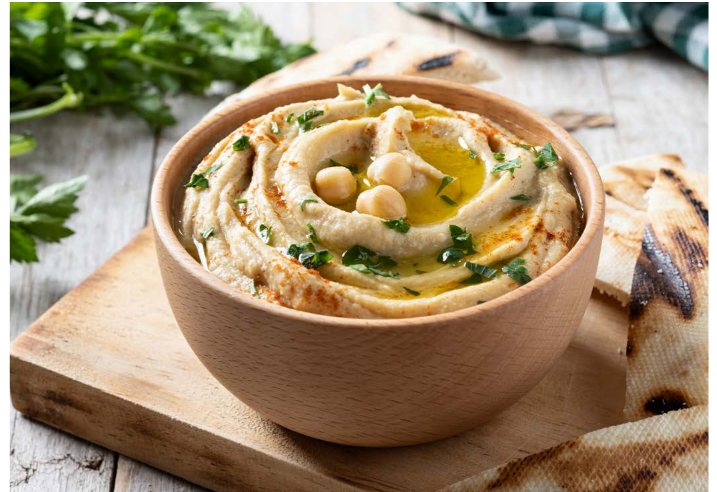
STONE GROUND TAHINI 400g