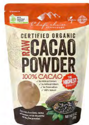
CERTIFIED ORGANIC RAW CACAO POWDER 300g

PRODUCT CODE: CACAO004 DIMENSION: L:16 x W:8 x H:23 cms EAN13: 9339337003424 ITF14: 19339337003421 BOX QTY: 10 PC/CTN $8.70