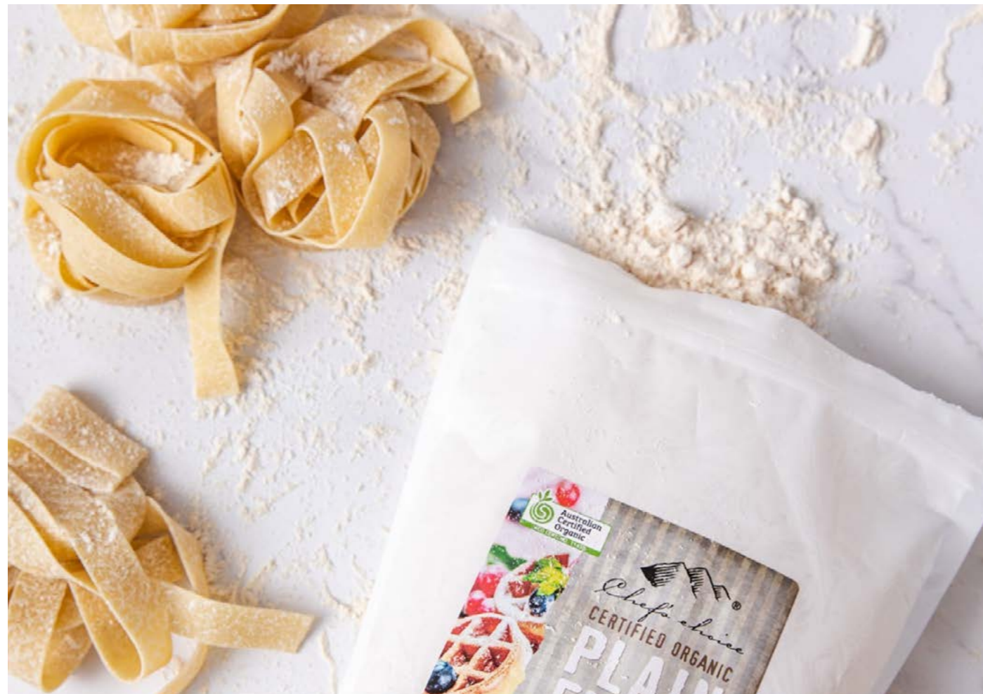
CERTIFIED ORGANIC PLAIN FLOUR - UNBLEACHED 500g