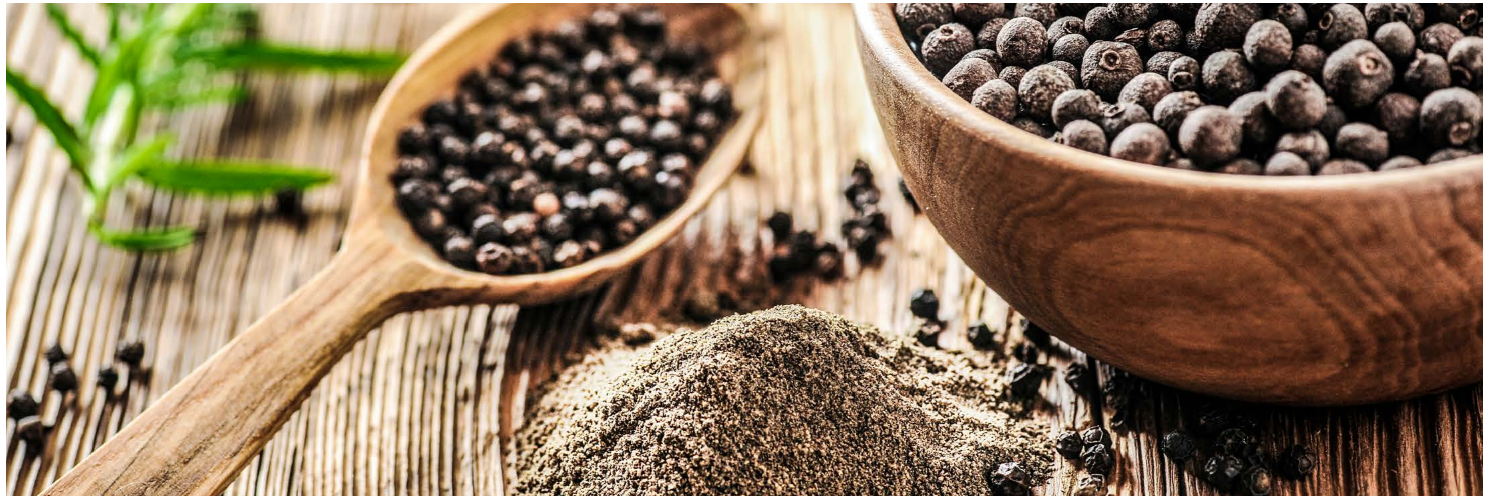
CERTIFIED ORGANIC WHOLE BLACK PEPPER WITH GRINDER - 100g