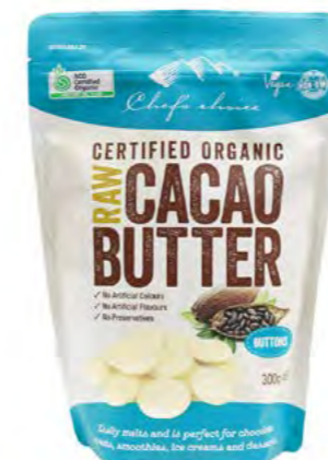
CERTIFIED ORGANIC RAW CACAO BUTTER 300g

PRODUCT CODE: CACAO006 DIMENSION: L:16 x W:7 x H:23 cms EAN13: 9339337004247 ITF14: 19339337004244 BOX QTY: 10 PC/CTN $9.00