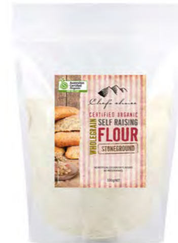
CERTIFIED ORGANIC STONEGROUND WHOLEGRAIN SELF RAISING FLOUR 500g

PRODUCT CODE: FLOUR028 DIMENSION: L:16 x W:7.5 x H:23 cms EAN13: 9339337003264 ITF14: 19339337003261 BOX QTY: 10 PC/CTN