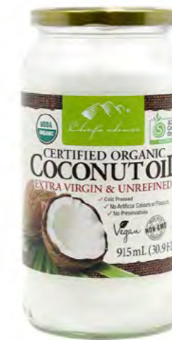
CERTIFIED ORGANIC COCONUT OIL EXTRA VIRGIN & UNREFINED 915ml

PRODUCT CODE: OIL027 DIMENSION: L:9.5 x H:18 cms EAN13: 9339337004933 ITF14: 19339337004930 BOX QTY: 6 PC/CTN $13.65